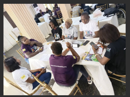
Group 3 busy with their task during the SP Retreat.