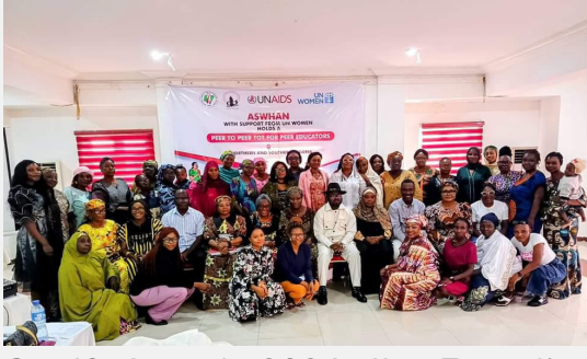
On 16 August, 2024, the Executive Director of Voice of Disability Initiative

On August 14, 2024, the Executive Director of Voice of Disability Initiative giving a speech at the ASHWAN program tagged: Closing the Gap, Breastfeeding Support for All.