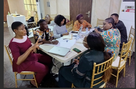
Group 2 busy with their task during the SP Retreat.