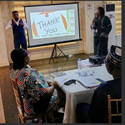
The ED giving her welcome speech