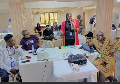
BoTs and the programs manager paying rapt attention during the Retreat