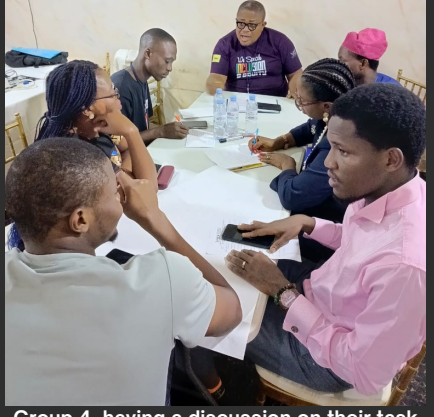
Group 4 having a discussion on their task during the SP Retreat.