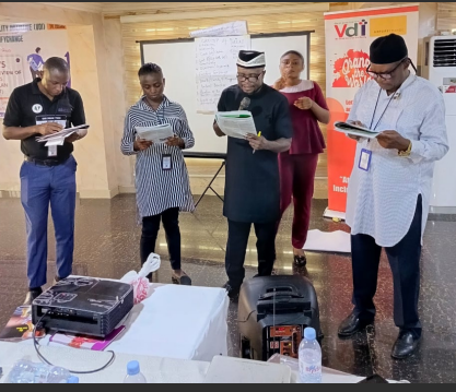
Group 1 presenting their findings from the SP Review.