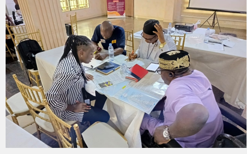
Group 1 busy with their task during the SP Retreat.