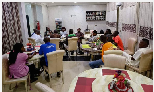
Cross Section of Staff and BOT during the Meeting