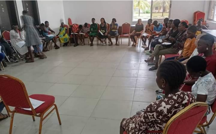
A cross-section of Out-of-school adolescent girls with disability in Life Skills training at Golden Tulip Apartments and Resort, Bayelsa State on 13th November 2024.