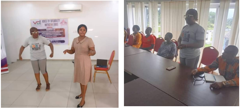
The Executive Director, VDI addressing the parents/caregivers of Adolescent Girls with Disability during the Sensitization/Dialogue Meeting on Tuesday, November 12, 2024.