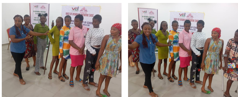
Role play on communication skills during Life Skills Training organized by VDI on Tuesday, November 12, 2024.