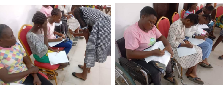
Self Awareness and Assertiveness session with adolescent girls with disability in Life Skills Training.