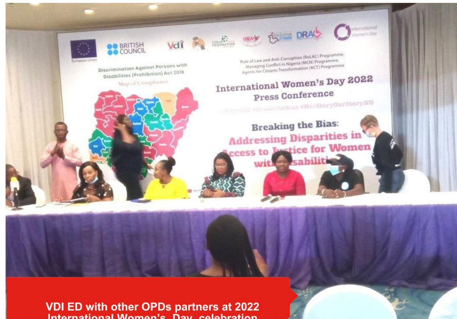
VDI ED with other OPDs partners at 2022 International Women's Day celebration

To advocate for the protection of rights of women, girls, and children with disabilities, and mainstreaming of disability-Inclusive programs into government policy Framework in Nigeria