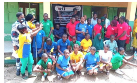
VDI team during a visit to school for Children with Disability in Abuja

The World "According to the World Health Organization, in 2018, noted that about 29 million of the 195 million people who comprise Nigeria's national population were living with a disability. Data from the 2018 Nigeria Demographic and Health Survey reveal that an estimated 7 percent of household members above the age of five (as well as 9 percent of those 60 or older) have some level of difficulty in at least one functional domain, seeing, hearing, communication, cognition, walking, or self-care; and 1 percent either have a lot of difficulty or cannot function at all in at least one domain.