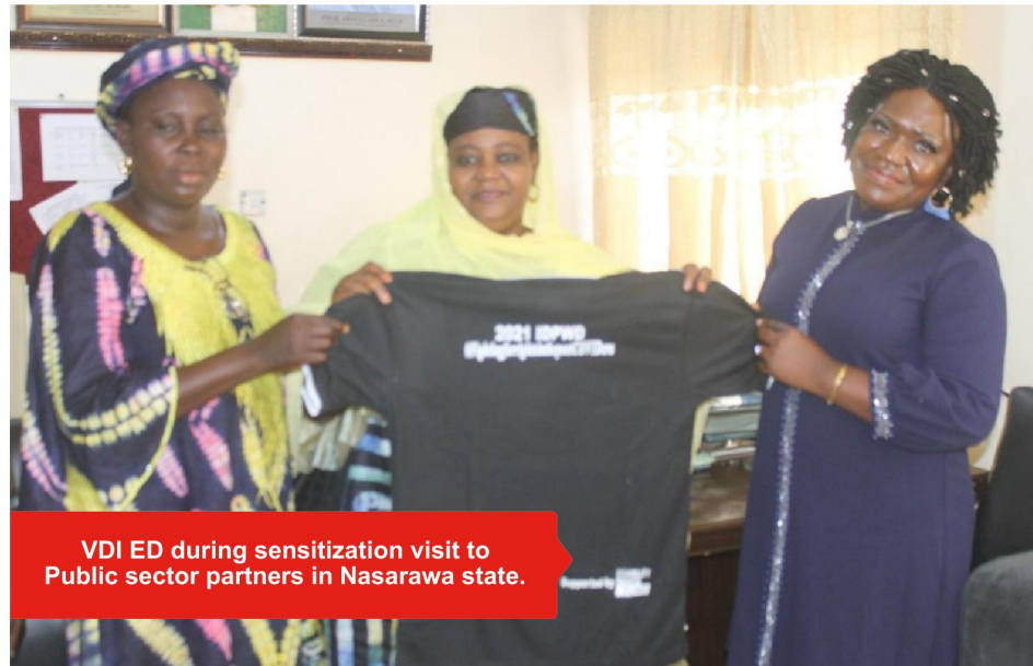
VDI ED during sensitization visit to Public sector partners in Nasarawa state.