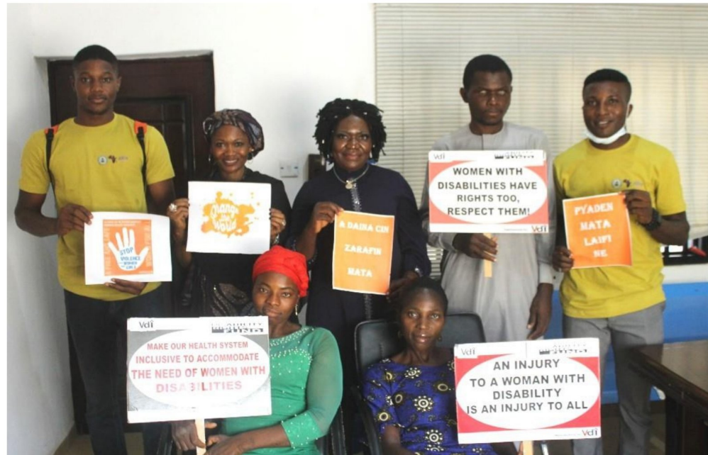
VDI team at a sensitization event

5 Livelihood - Access to improved livelihoods by women, girls, and children with disabilities, mainstreaming market system development (MSD), improved life-skills, knowledge and access to finance and capacity to earn income that sustain them and support their families. Economic empowerment of women especially women and girls with disabilities provide an inclusive economic growth.