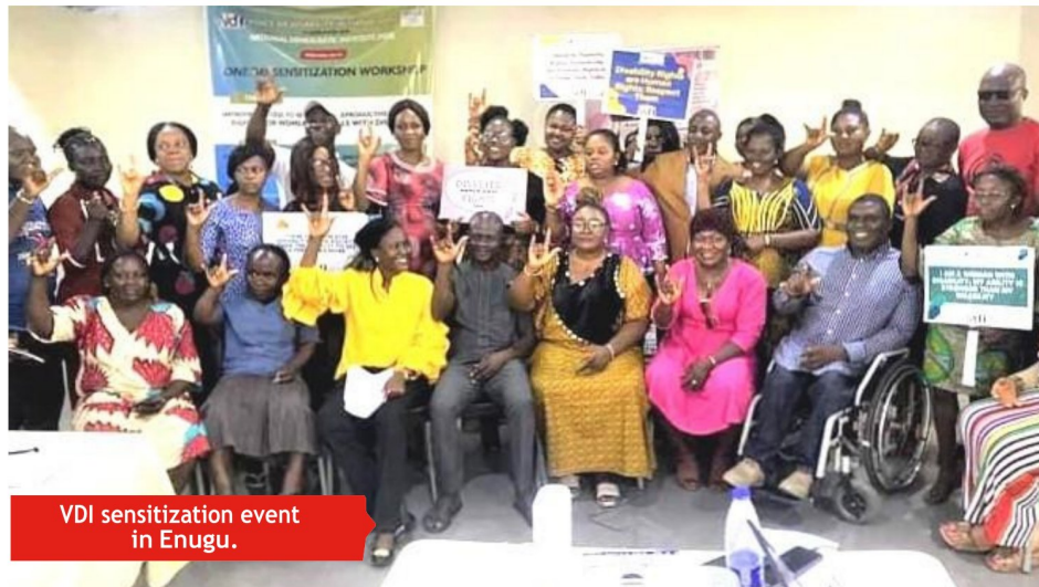
VDI sensitization event in Enugu.

“ VDI engaged the Enugu State Government, in Nigeria’s South East zone on domesticating the Disability Act at state with a proposal for A Bill titled: Enugu State Discrimination against Persons with Disabilities (Prohibition) Bill (2022).”