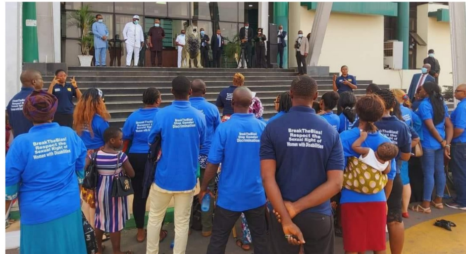
The Governor of Enugu State Ifeanyi Ugwuanyi addressing VDI members during an Advocacy visit.

In addition, it will integrate organizational targets including interventions to drive program design, resource mobilization and allocations, implementation strategy, monitoring and evaluation, communication and knowledge management.