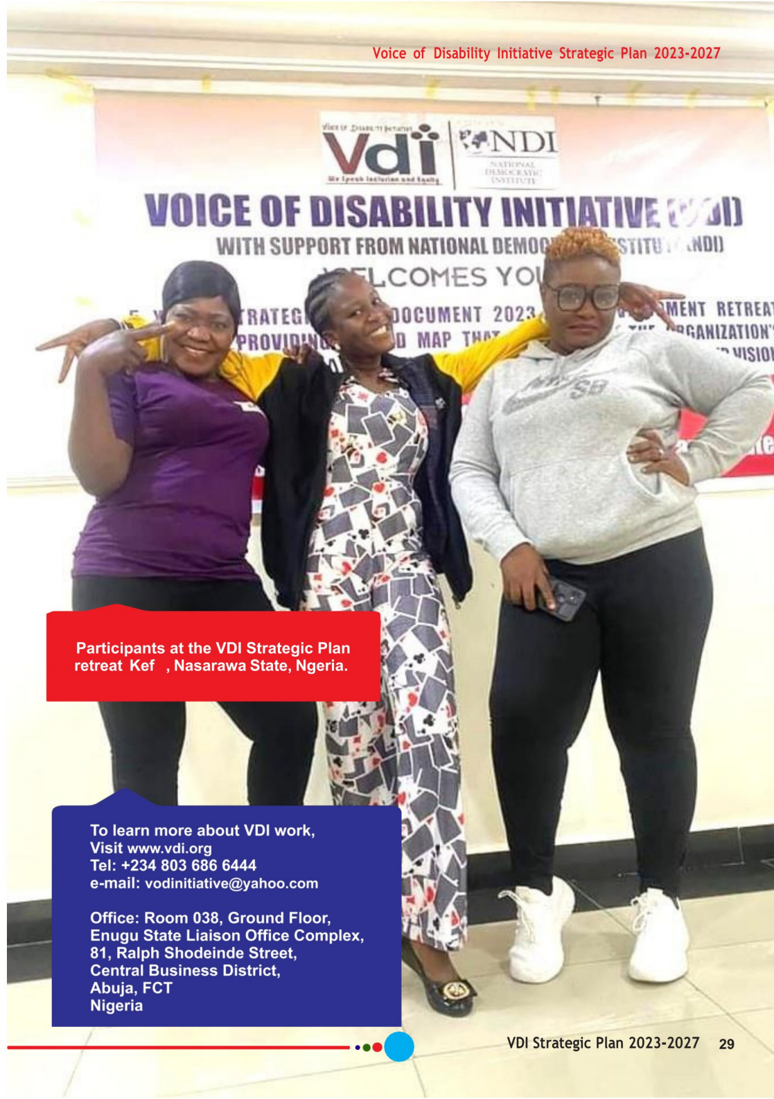
Participants at the VDI Strategic Plan retreat Keffi, Nasarawa State, Nigeria.

To learn more about VDI work, Visit www.vdi.org Tel: +234 803 686 6444 e-mail: vodinitiative@yahoo.com Office: Room 038, Ground Floor, Enugu State Liaison Office Complex, 81, Ralph Shodeinde Street, Central Business District, Abuja, FCT Nigeria