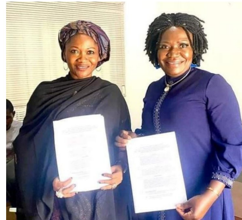
Nasarawa State Liaison officer, National Agency for the prohibition of Trafficking in Person (NAPTIP) and Executive Director, Voice of Disability Initiative display the MoU at Partnership Agreement signing event in Lafia, Nasarawa State.

Potential funding and implementing partners will be attracted to VDI with intense intervention plan for the community of PWDs.